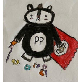
Ollie the Outstanding Owl